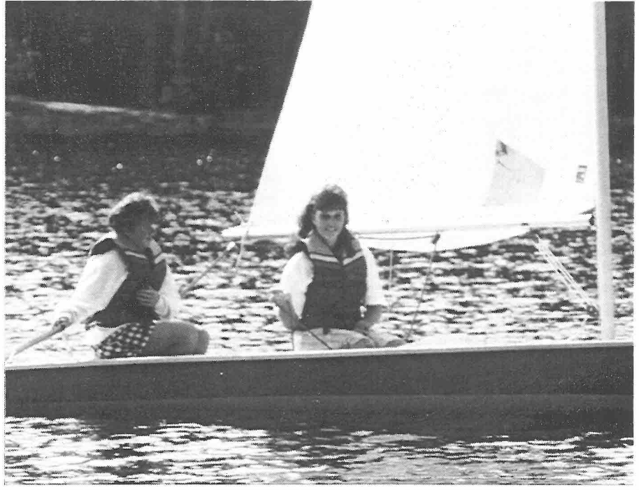
Keep These Kids Happy! - Volunteers help make our Youth Sailing Program possible.