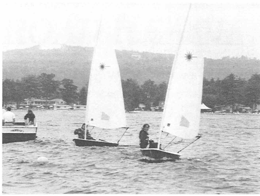
Get ready for Summer Action!